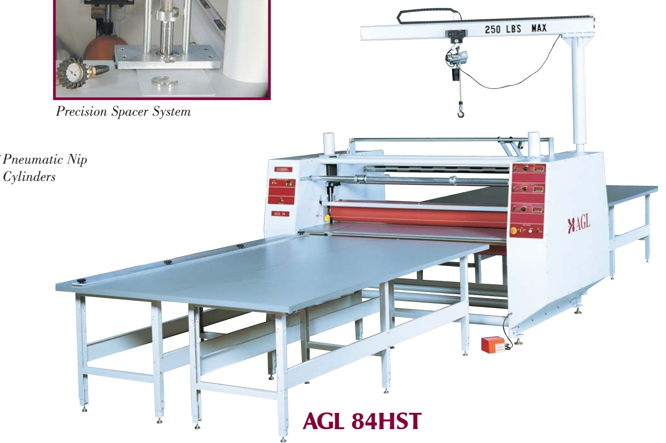
Heated silicone top nip roll with top let-off, release liner wind-up station, and overhead jib crane assembly for easy roll handling.