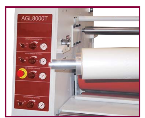
Cantilevered Material Shafts