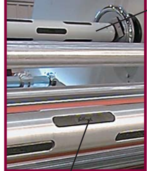
Proportional Electronic Tension Transducer for Automatic Web Tension Control

Top and Bottom Mounting and \( \) Laminating