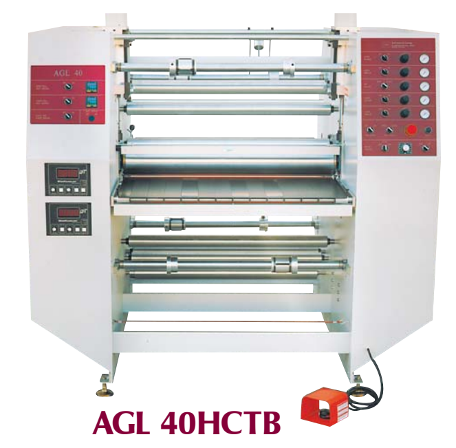
Heated chrome top nip roll with heated silicone bottom nip roll. Top and bottom let-off stations and release liner windup stations. Dual automatic transducer tension control and segmented