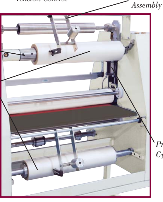
Safety Chuck Assembly for roll weights >200 lbs.